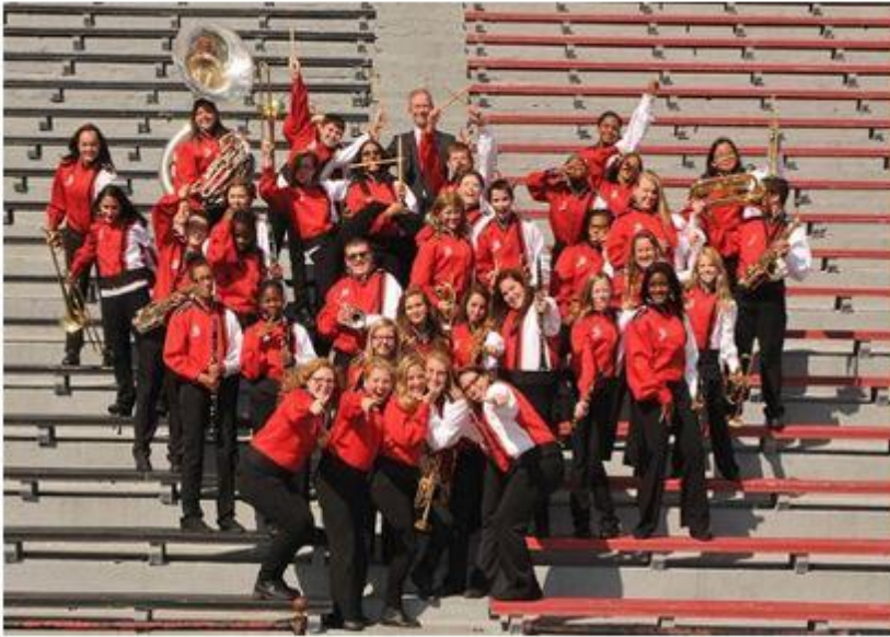
TO EDUCATE, MOTIVATE AND INSPIRE